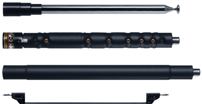
HFJ-350M (sold separately) 3.5-50MHz 9-Bands Portable Telescopic Antenna